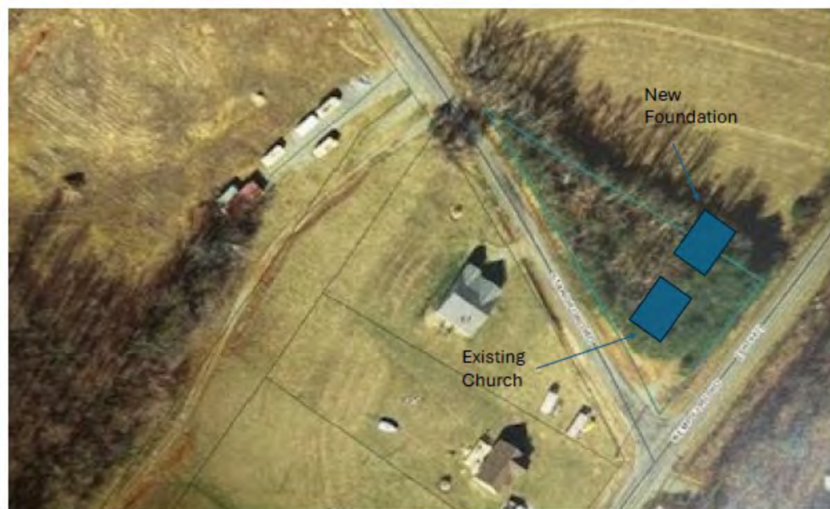
Sketch of Union Hall Church