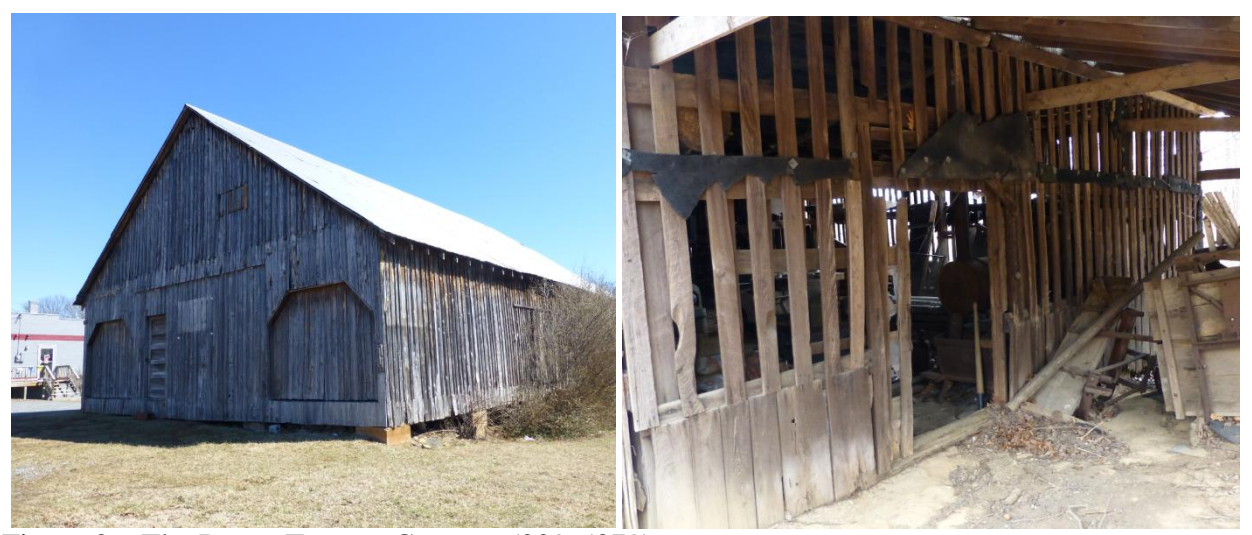
Figure 36. The Peters Tomato Cannery (009-5379).

The introduction of large-scale commercial tomato cultivation to the county in the early twentieth century necessitated facilities for processing the crop and preparing it for shipment to market. Any barn or other building large enough to house the workers and machinery during the brief summer canning season would do but many producers constructed purpose-built canneries. Typically these were long one-story buildings that reflected the assembly-line nature of the production process which began with receiving and continued on to scalding, peeling, canning, boiling the cans, labeling, boxing, and shipping.