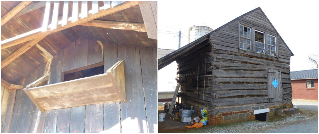
Figure 28. The hopper in the gable of the corncrib on the Anderson Farm (009-5399). Figure 29. The lower level of this log building on the Harper Farm (009-0009) has features consistent with former use as a granary.

An exception to the generally small size of the county's corncribs is the corncrib at Wipledale Farm (009-5344), a building on the scale of a dairy barn that may have been built in the 1930s. The corn storage area occupies the second floor of the long building, the first floor utilized as a machine shed. The corncrib level's horizontal siding boards, like weatherboards in appearance, are separated one from the other by spacer blocks to enhance air flow, a construction feature that gives the building superior ventilation but sheds the rain. The survey recorded several examples of prefabricated metal corncribs with perforated sides. The ones on the Tanner Farm (009-5138) and Terrapin View Farm (009-5395) are circular in form. The Tanner Farm corncrib features a center ventilation shaft that rises to a cupola at the apex of the conical roof whereas the corncrib at Terrapin View Farm has the name "Buckeye" embossed on its door, possibly an indication the structure was fabricated by the Buckeye Manufacturing Company in Anderson, Indiana. Berkeley (009-0025) has two metal specimens similar in concept but with oblong forms. Something of the inventive quality of these manufactured corncribs is evoked by the early twentieth century corncrib on the Anderson Farm (009-5399), notable for the hopper-like scoop in its gable which funneled tossed corncobs to the interior.