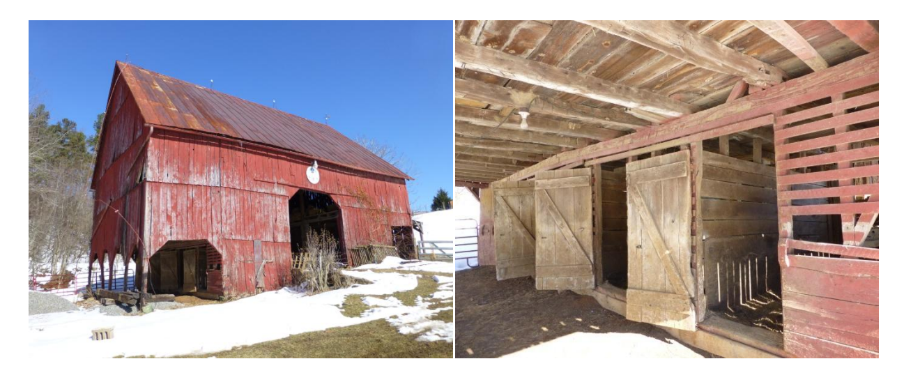
Figure 13. The partial bank barn on the Blair Farm (009-5375). Figure 14. Animal stalls under the haymow of the barn on the Blair Farm (009-5375).

A number of barns were built in what may be called a half-bank form. An example of the form is the frame barn on the Blair Farm (009-5375) which was probably built in the early decades of the twentieth century although it reuses hewn timbers from an earlier building (possibly a barn). Not only does the Blair barn have a half-bank form, its design is split-level; the south end, to the left of the center drive-through, has lower-level animal stalls the upper portions of which rise several feet above the drive-through floor, whereas the north end is level with the drive-through. The Blair barn is also notable for various provisions for the care of the animals housed in the lower level such as a porch-like drive-through in front of the stalls; latticed openings on front of the stalls to facilitate ventilation; and openings at the back of the stalls above the center drive-through floor through which hay from the mow above could be easily forked to the animals below.