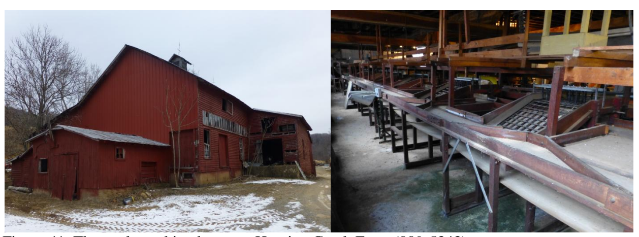
Figure 41. The apple packing house at Hunting Creek Farm (009-5343). Figure 42. Machinery in the Logwood Apple Packing House (009-5117).

Later in date but equally well preserved is the Logwood Apple Packing House (009-5117) built in 1955. The long cinder block building with its distinctive stepped gable parapets and a painting of an apple on front-end doors is similar to the Hunting Creek facility in its interior arrangements. It too retains conveyor belts for grading and has a loft formerly used for storage of the collapsed apple boxes. An interesting feature is the building's structure of heavy oaken posts that support the loft. Early in the building's history, when the posts turned out to be in the way of the women working at the grader, owner Lloyd R. Logwood added the present system of heavy bents to provide greater clearance. Logwood was another member of the top four growers in 1949 at which time he operated out of a retrofitted barn.<sup>29</sup>