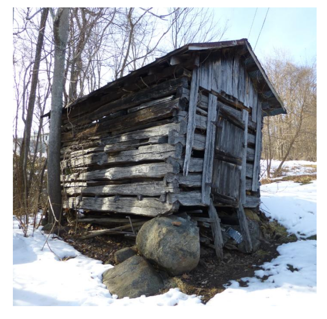
Figure 25. The "old" corncrib on the Agee Farm (009-5371).

often smaller than the main crib. Perhaps the front compartment was used as a covered area to shuck small quantities of corn. Larger quantities were often shucked in boisterous open-air gatherings known as corn shucking.<sup>21</sup>