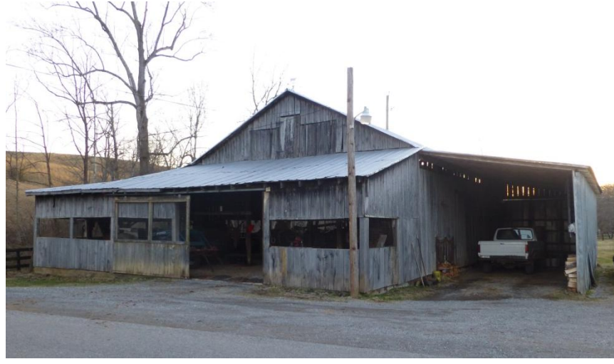
<sup>26</sup> Heritage of Bedford County (2003), 27-28.

worked was enclosed the scalding vat and boiler stood under an open shed at the building's north end and the scalded tomatoes passed into the building on a conveyor for peeling. An interesting feature of the cannery is its roof which incorporates log beams in its construction. Similar construction spans the original and 1950s sections, suggesting the possibility that the roof over the 1950s section survived the fire that destroyed the fabric under it. A concrete trough formerly channeled creek water to the interior and troughs in the concrete floor—present troughs and traces of former ones—lead to a drain that emptied into the creek. The Johnson cannery had one other feature that enhanced the comfort of the workers: louvered roof-ridge cupolas that drew air through the building and exhausted heat to the outdoors. Although the cannery, like the county's other surviving canneries, is no longer in operation, it was partially restored in recent years by the late Billie Cutshaw and is maintained by current owner Marie Cutshaw.