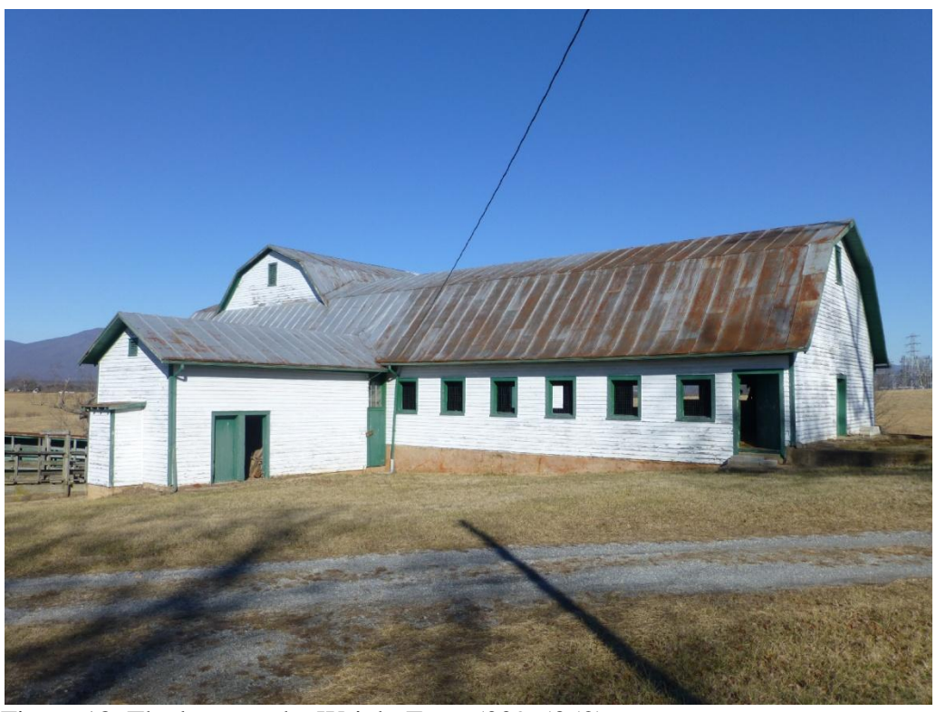
Figure 18. The barn on the Wright Farm (009-5352).

for the existence of a "controllable flue system." "Tight" or "impervious" floor, wall, and ceiling surfaces were encouraged, achieved by the concrete floors and tongue-and-groove-sheathed walls and ceilings of local dairy barns. Farmers were encouraged to provide separate rooms for washing utensils and handling milk in their milk houses. <sup>16</sup>