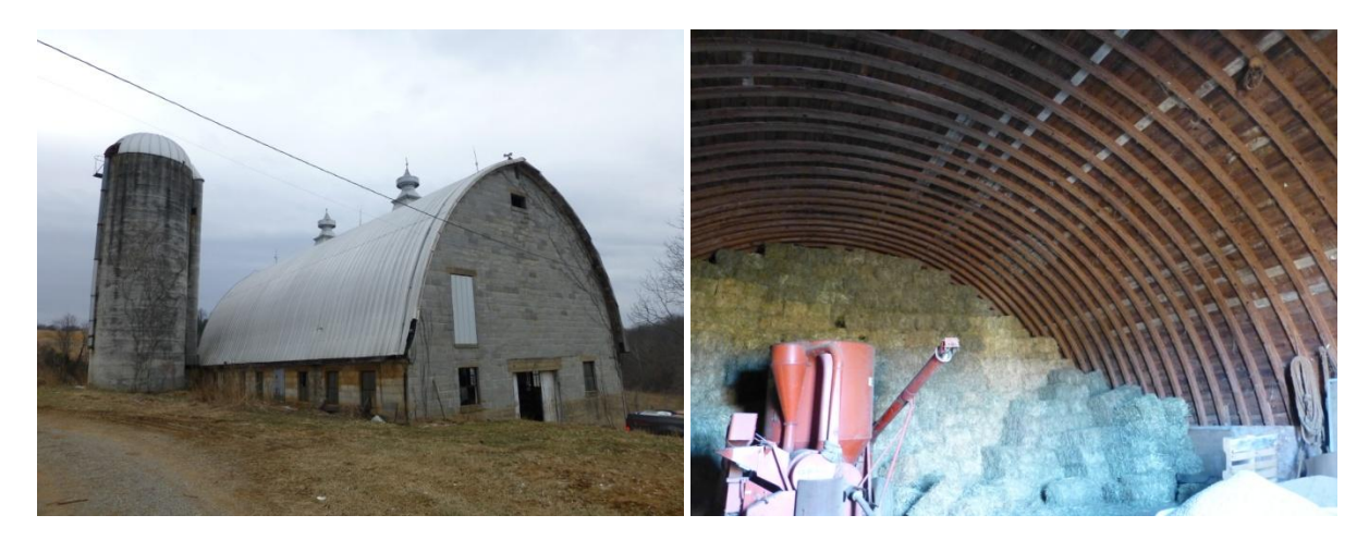
Figure 10. The Gothic Arch roof of the dairy barn on the Parkdale Farm (009-5107). Figure 11. Bentwood rafters in the barrel-vaulted haymow of the barn at Groveland (009-5404).

The epitome of the self-supporting form was the so called Gothic Arch roof popular from the 1910s through the 1950s. The Gothic Arch roof, which has the curved and pointed profile of the Gothic lancet arch, is represented in the survey by the roof on the 1947 cinder block dairy barn at Parkdale Farm (009-5107). Gothic barn roofs and roofs with continuous curves typically utilized thin wood sections that were bent, layered in multiple plies, and glued and/or nailed together to create curved rafters. The technique was first publicized in 1916 and by the 1930s was widely adopted by progressive farmers. The barrel-vaulted bentwood-rafter haymow of the ca. 1950 barn at Groveland (009-5404) is a premier example of the form. <sup>13</sup>