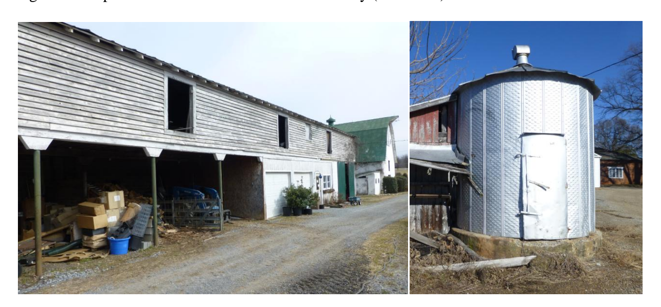
Figure 26. The large corncrib at Wipledale Farm (009-5344). Figure 27. A prefabricated metal corncrib at Berkeley (009-0025).

not one but two corncribs, called by the family the old and new corncribs. The old crib is constructed of v-notched logs and rests on boulders for support. The new crib, a frame structure on slender poured concrete piers, is sided with weatherboards up to a wire-mesh opening that runs under the eaves to provide ventilation.