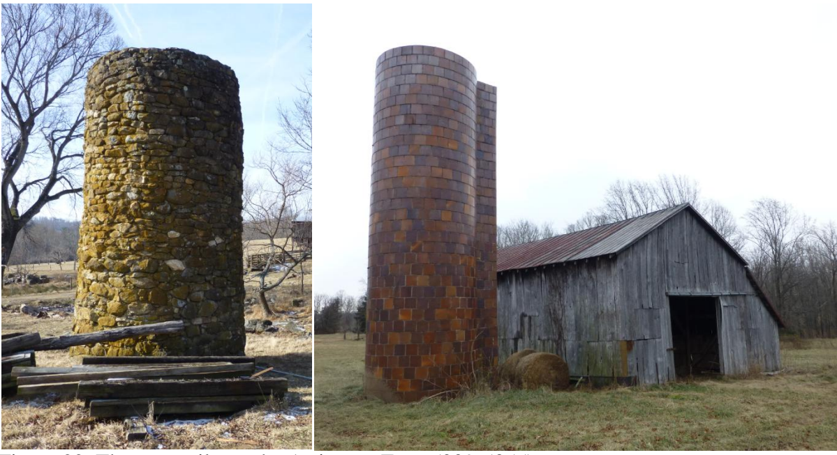
Figure 22. The stone silo on the Arrington Farm (009-5355). Figure 23. The tile block silo beside the Chappelle Barn (009-5345).

Wood construction gradually gave way to more durable materials. The attractive stone and poured concrete silo on the Arrington Farm (009-5355) was built by brothers Harry, Onyx, Morris, and Joseph Arrington in the mid-1930s when the four were boys or young men. The barn attached to the Arrington silo is now gone. Charles Ervin Woolfolk also built a stone silo in the 1930s at his farm just outside Bedford (009-5388). Concrete was the most popular silo material in the county. Early examples, such as the silo attached to the ca. 1935 barn on the Simmons Farm (009-5381), were poured in forms, however most surviving historic-period concrete silos were built from prefabricated concrete staves that slotted together and were held in place by steel tension rings. The example on the Cridlin Farm (009-5348) was built with components (the concrete staves or perhaps only the domical metal roof) manufactured by the Marietta Silos company of Marietta, Ohio, as indicated by the metal logo on its weathervane.