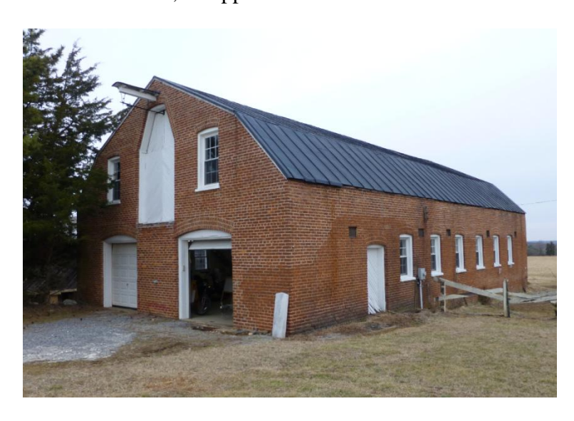
Figure 8. The horse barn at Savenac (009-0030).

dispensed with crossbeams and were in their later iterations self-supporting. Two forms were introduced in the 1880s and 1890s. The form known to barn researchers as the Open Center/Wing Joist form supported the haymow roof from the sides but still required heavy posts under the purlins at the breakpoints of the gambrel. Another approach, the Shawver Truss form, reinterpreted the barn's wall and roof structure as a series of trusses that tilted inward to meet at the ridge and spanned the haymow space from wall to wall without intermediate posts. Ohio inventor John L. Shawver noted of his truss roof form, "the principle of its construction has been in use many years in bridge engineering." In 1902 Shawver estimated (perhaps with some exaggeration) 5,000 barns had been constructed according to his design. Further advances in the early twentieth century simplified the truss form by utilizing smaller-length members built up to create the trusses, an approach that borrowed from balloon-frame construction. <sup>12</sup>