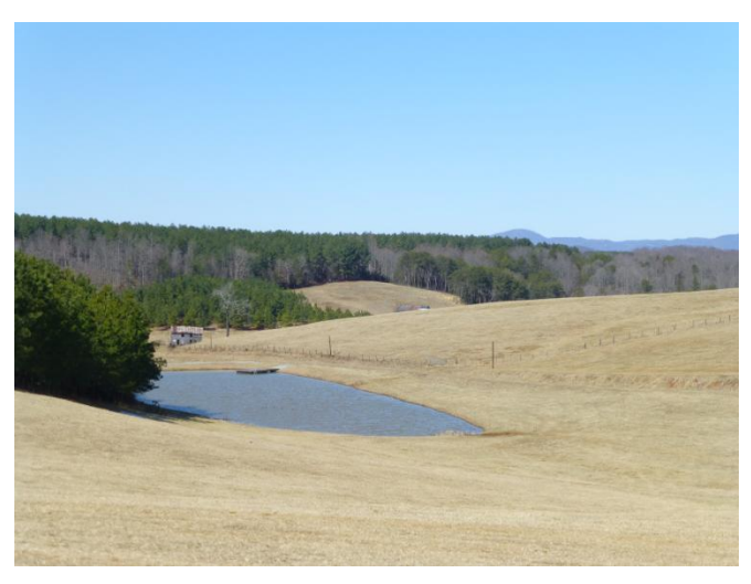
Figure 2. A representative Bedford County farm landscape at the Hicks Farm (009-5378) in the Moneta vicinity: rolling hayfields encompassed by wooded slopes, the Blue Ridge in the distance.

especially after World War II, commercial dairying. The second half of the twentieth century was dominated by cattle production and the growing of corn and hay for animal feed. According to the Bedford Office of Economic Development, in 2007 county farms generated approximately $23.6 million in sales annually. Over half of the total ($12.2 million) was from sales of cattle and calves. Milk sales accounted for $7 million. No tobacco sales were noted.