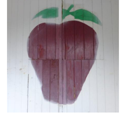
Figure 5. Painting on the doors of the Logwood Apple Packing House (009-5117).

produced Albemarle, Pippin, Winesap, York, and other apple varieties. Peaches, plums, and grapes were also grown on the farm. With apple production, as in tomato production, after an initial flush the bloom wore off. County Agent S. S. Hylton wrote in a 1954 article on the county's agriculture that apples and peaches were "still an important source of farm income" but orchard acres had been "drastically curtailed in recent years."