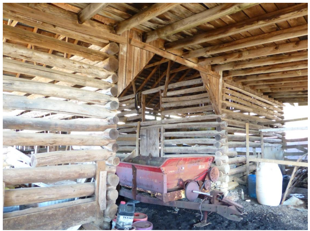
Figure 16. The double-crib log barn on the Key-Shackford Farm (009-5377).

The county's multipurpose barns tend to be the farm buildings where various technological advances are most often found. Principal among these, at least in number, are hay carriers, and most surviving examples utilize grappling-type hay forks. A clue to the presence or former presence of a hay fork system is provided by the hay bonnets or hoods that project from the roof peaks of many frame and masonry barns. Generally hay bonnets have a small triangular or wedge form sufficient only to shelter the boom that supports the short extension of the hay fork track outside the barn, however the 1920s Spradlin Barn (009-5368), a small frame hay and stock barn, features a full strut-supported extension of the gable roof which in addition to protecting the hay fork rail may have served to shelter a hay wagon parked below during off-loading. The log barn on the farm at 2588 Saunders Road (009-5376) is interesting as a fusion of the age-old vernacular tradition of log construction and a hay bonnet indicative of technological innovation. A multipurpose barn that utilized the old-fashioned hand-pitched hay loading method is the small early twentieth-century stock and hay barn on the Jeter Farm (009-5380) where the hay was loaded into the mow from a wagon or truck parked in the drive-in bay beside the mow.