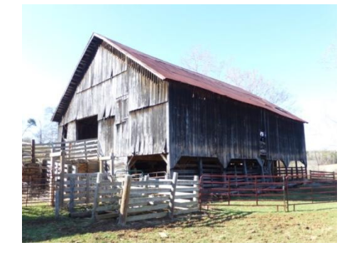
Figure 12. The bank barn on the Nance Farm (009-5402).

Many, especially the smaller examples, retained the traditional gable form. Bedford County has a number of interesting barns that are variants of the bank barn form. Bank barns are traced to German-speaking lands in Europe and were introduced to Virginia by Germans who primarily settled west of the Blue Ridge. The twentieth-century barn on the Carner-Croft Farm (009-5123) is one of the county's rare examples of the fully realized bank barn form. Another is the ca. 1920 barn on the Nance Farm (009-5402).