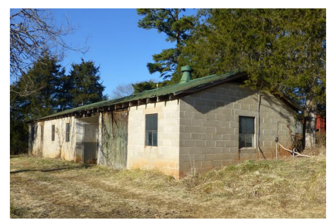
Figure 20. The milking parlor on the Cridlin Farm (009-5348).

Not all of the county's dairy herds were as large as the ones at the Wright Farm and Redlands and not all farm owners required sophisticated facilities. In fact, on at least two farms in the survey, the Agee Farm (009-5371) and the Howell Farm (009-5346), milking was done outdoors until the 1950s when the farm owners built small frame milking parlors (to the relief of their hard-worked sons). Milking parlors might be housed in sheds attached to preexisting barns, as was the case on the Ashwell-Ayers Farm (009-5356) where a frame milking parlor was added to a 1930s log hay barn in the 1950s. A similar frame shed on the log Watson Barn (009-5361) has attributes of a milking parlor.