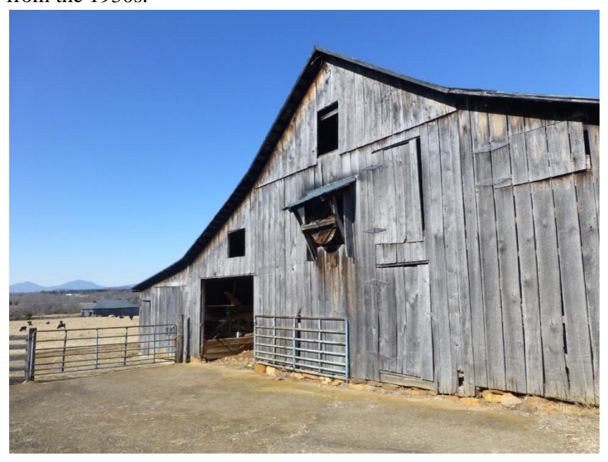
Figure 3. The horse barn at Rothsay Farm (009-5351).

That poor farming practices were already harming the soil in the eighteenth century is attested to by an archaeological discovery at Poplar Forest. Under an area used by Thomas Jefferson for an ornamental plant nursery in the early nineteenth century, archaeologists have uncovered a gully that measured (before Jefferson had it filled) four feet deep, up to twenty-five feet across, and more than eighty feet in length. The discovery suggests that by 1800 portions of the county had the appearance of the eroded farms documented by the Soil Conservation Service in photographs from the 1930s.<sup>3</sup>