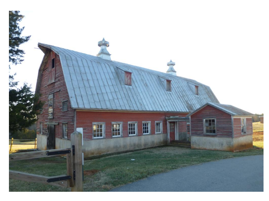
Figure 6. The County Farm Barn (009-5031), a 1936 dairy barn.

The nascent dairy specialization of the late nineteenth century gained momentum in the early twentieth century. S. S. Hylton dated the switch in emphasis from the old reliance on tobacco to livestock-based agriculture, both dairying and beef cattle raising, to the late 1920s. The early twentieth century was marked by consolidation in the dairy industry and by sanitary regulations that responded to the growing scientific understanding of the role of bacteria in illness and methods for reducing bacteria in dairy products. Historian Sally McMurry writes, "A new infrastructure developed to funnel milk from farm to city . . . Over time, large corporations organized the milk supply across an ever wider geographic area. They built local plants where their 'patrons' delivered milk to be pasteurized, bottled, cooled, and sent to market. Truck transport, via a developing highway system, expanded the 'milk shed' (analogous to a watershed) beyond rail routes by the 1930s." <sup>10</sup>