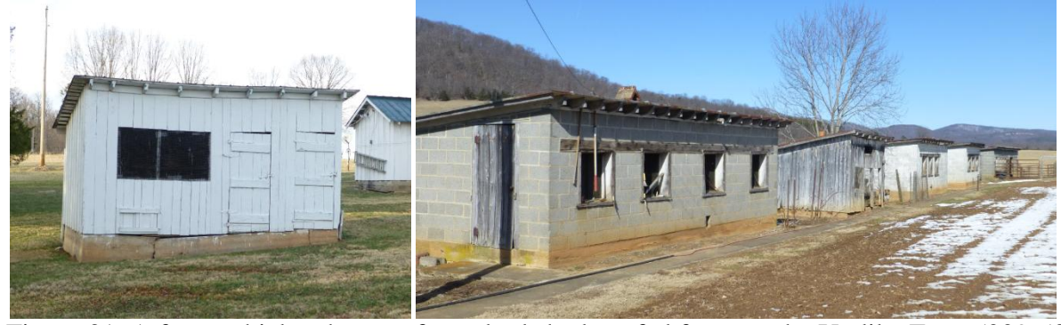
Figure 31. A frame chicken house of standard shed-roofed form on the Updike Farm (009-5394). Figure 32. A row of chicken houses on the Markham Farm (009-5372).

frame buildings, were used to rear bantams and red chickens. Most twentieth-century chicken houses were frame although cinder block was also used and a brick example was recorded by the survey on the Blair Farm (009-5375). The standard form of the era was a relatively small building of rectangular plan covered by a shed roof. The shed-roofed form was a staple of howto articles and agricultural bulletins. The building type's higher side elevation was often oriented to the south and fitted with glazed or mesh window openings to admit the warmth of the sun. In Bedford County the form was already in use by the 1920s when a shed-roofed chicken house was built at Twin Oaks Farm.<sup>23</sup>