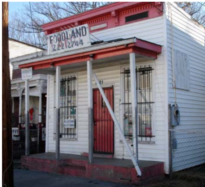
A business building in Richmond's Church Hill neighborhood.

Finally, census information now is readily available online through various private companies. One of the most well-known paid subscription