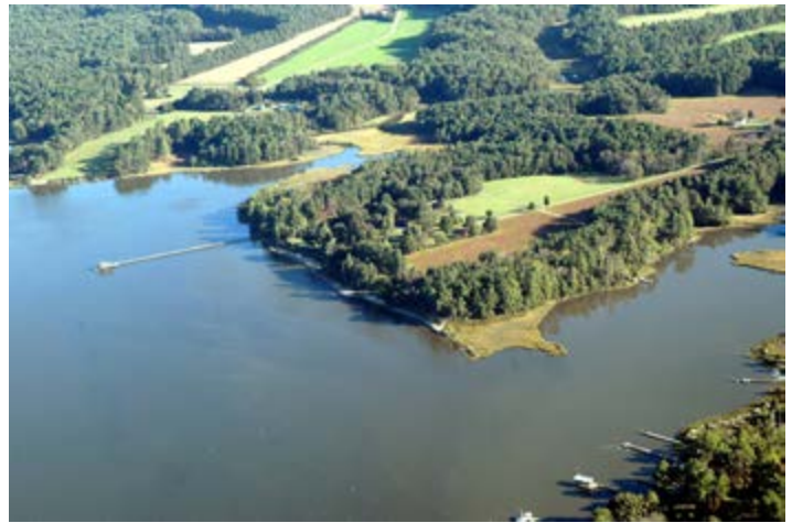
Archeological Site of Werowocomoco, Gloucester Co.

Aerial photographs can provide documented history information as to the progression of a site on which a resource is located. They can