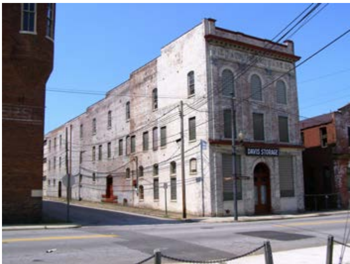
A commercial building in the Danville Tobacco Warehouse Historic District.

writes letters about his journey may comment at length on what to him appears unusual, often in highly opinionated and judgmental language. Look, then, for travelers' diaries and letters that pertain to your area; some may have been published in local historical society magazines.