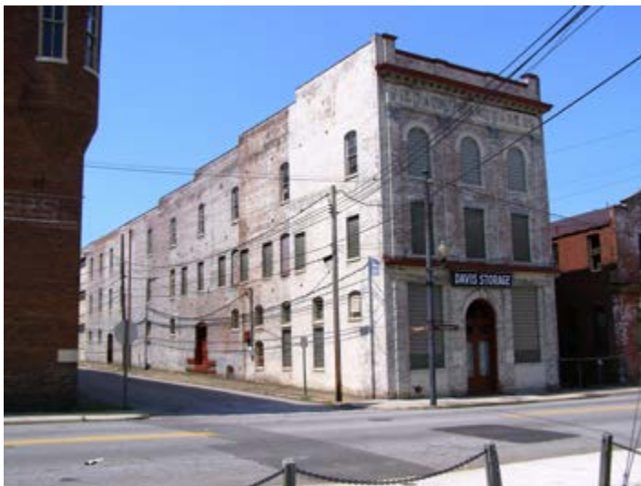
A commercial building in the Danville Tobacco Warehouse Historic District.

writes letters about his journey may comment at length on what to him appears unusual, often in highly opinionated and judgmental language. Look, then, for travelers' diaries and letters that pertain to your area; some may have been published in local historical society magazines.