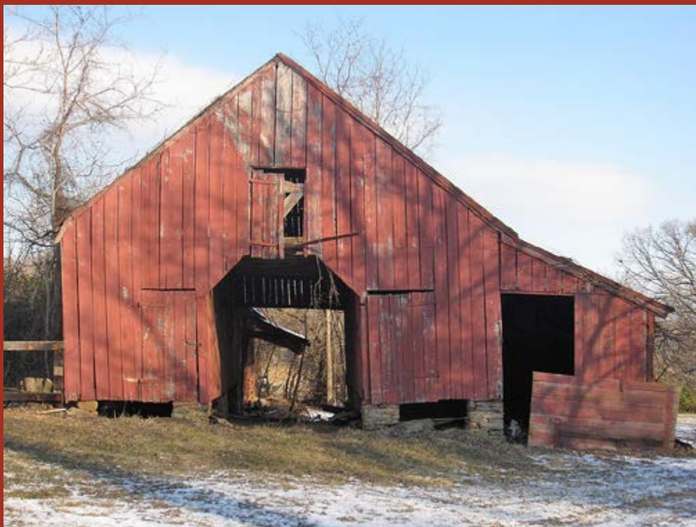
Corncrib / barn at Furr Farm in 2012, Loudoun County.

Researching Your Historic Virginia Property was financed in part with funds from the U.S. Dept. of the Interior, through the Department of Historic Resources. Under Title VI of the Civil Rights Act of 1964 and Section 504 of the Rehabilitation Act of 1973, the U.S. Dept. of the Interior prohibits discrimination on the basis of race, color, national origin, or handicap in its federally assisted programs. If you believe that you have been discriminated against in any program or activity described herein, or if you desire further information, please write to: Office of Equal Opportunity, U.S. Dept. of the Interior, Washington, D.C. 20240. The contents and opinions of this report do not necessarily reflect the views or policies of the Dept. of the Interior, nor does any mention of trade names or commercial products constitute endorsement or recommendation by the Dept. of the Interior. The Virginia Department of Historic Resources, in accordance with the Americans with Disabilities Act, will make this publication available in Braille, large print, or audiotape upon request. Please allow 4–6 weeks for delivery.