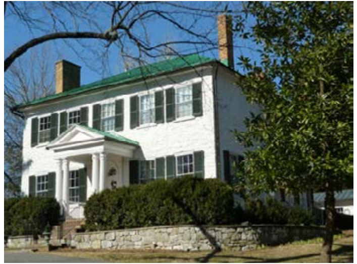
Hawthorne and Old Town Spring in Winchester was the residence of Civil War diarist Cornelia Peake McDonald.

Besides the patents and grants, which like deeds give the metes and bounds of the property, the researcher will find the extant plats useful. Unfortunately, the Land Office burned the plats annually before 1774 once the patent had been issued, so few colonial plats survive. An exception is the Northern Neck Proprietary, which kept its plats. Plats are generally available after 1779 statewide, and some of them show—besides the boundaries of the property—watercourses, woodlots, and dwellings.