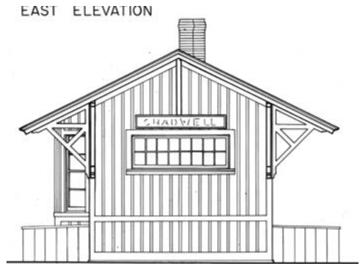
Detail from a HABS scale drawing of the Shadwell train station, Albemarle Co. (Library of Congress)

Private individuals with an interest in a particular topic also often maintain websites or