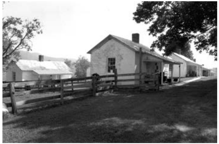
The former Wythe County Poorhouse.

For most localities, indexed will books (in which all the foregoing documents were recorded) exist as well as the original papers. The state archives