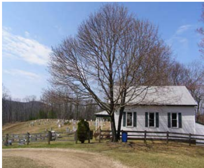
Haines Chapel, circa 1914, and Cemetery, Rockbridge Co.

One of the first things you should do is place your property in the context of its surroundings—think broadly, not narrowly. Your property has been part of a neighborhood or community for a long time. Some